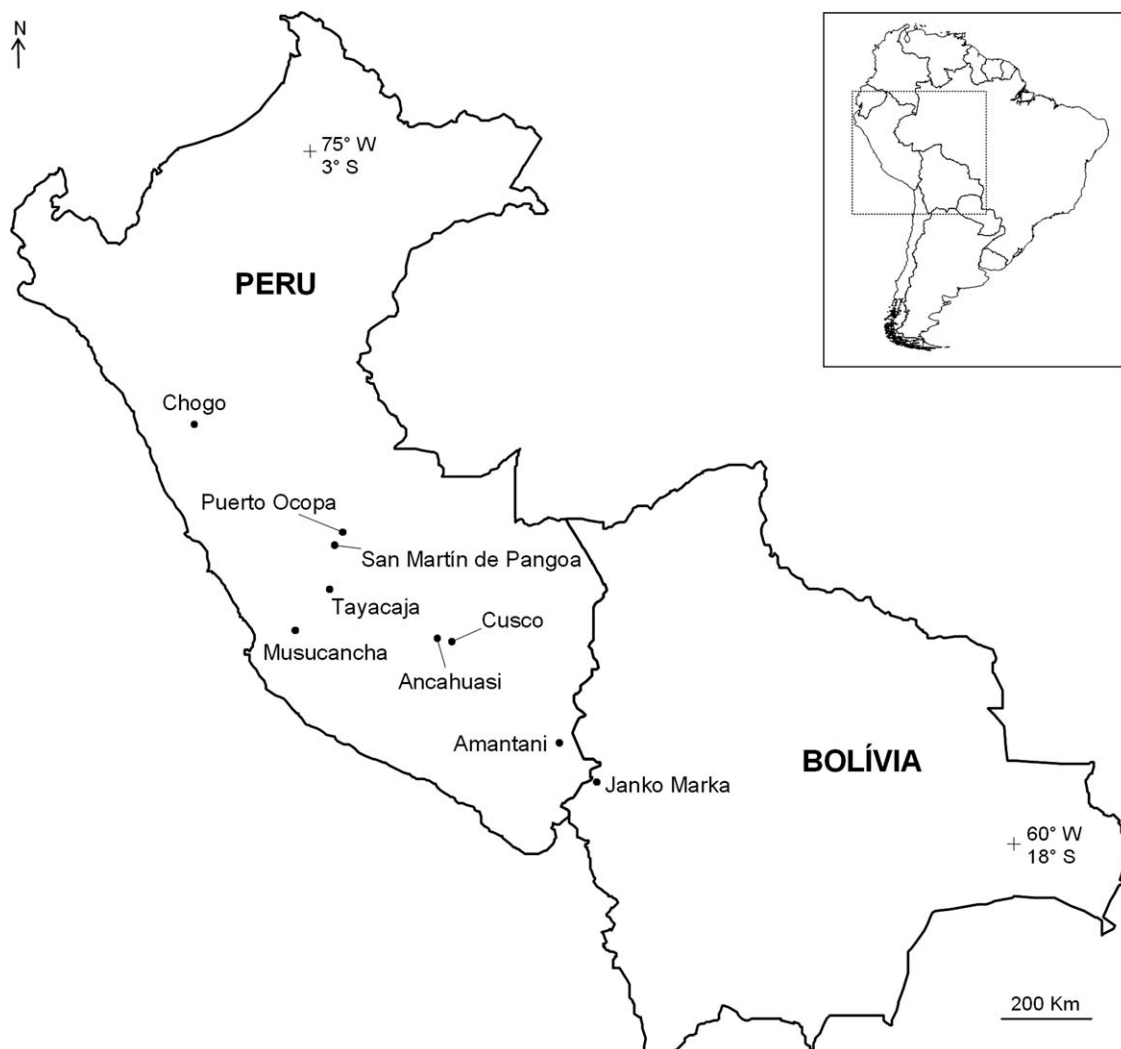
Fig. 2. Sample locations for individuals bearing the derived allele at marker SA01.

a Codes for haplotypes found in South American populations: JMK, Janko Marka, Bolivia ( n = 1 ); AMT, Amantani, Peru ( n = 1 ); CHG, Chogo, Peru ( n = 6 ); SMP, San Martín de Pangoa, Peru ( n = 1 ); CUS, Cusco, Peru ( n = 1 ); ANC, Ancahuasi, Peru ( n = 1 ); TAY, Tayacaja, Peru ( n = 2 ); MUS, Musucancho, Peru ( n = 2 ); POC, Puerto Ocopa, Peru ( n = 1 ). See Figure 2 for sample locations. b DYS389a-b: Allele designations according to Tarazona-Santos et al. (2001).